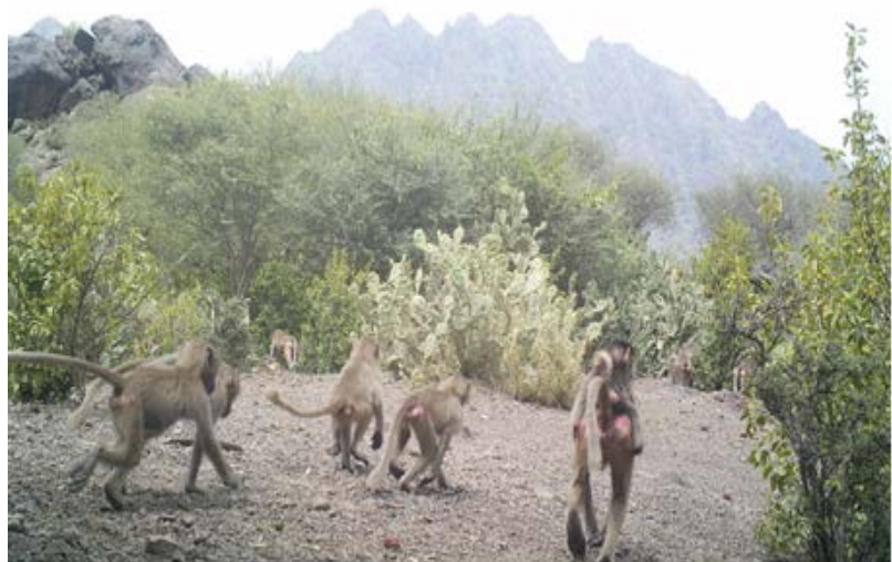
Opentia invasion caused mainly by baboon outbreak in Milhan

Wildlife surveys continue in different parts of Yemen including: Jebel Milhan, Mahwit; Bura'a, Hodeidah; Wadi Sharis, Hajjah, and various locations in Ibb governorate, by well-trained young Yemeni conservationists. Many important species have been recorded for the first time by camera traps. Surges of some species have been observed due to the decimation of top predators, which is quite alarming considering the significant resulting ecosystem disturbance. More results from the field will be posted in the coming issues.