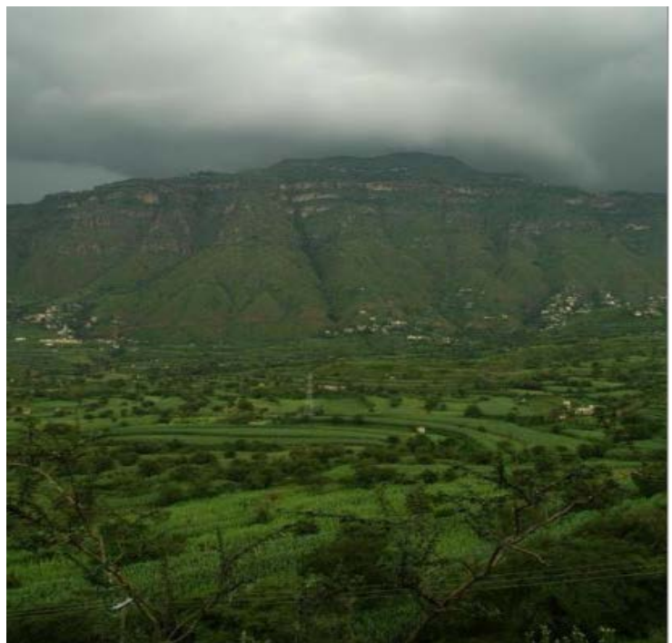
View of the fascinating mountains of Ibb governorate