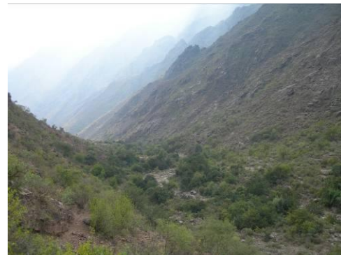
“Beware of the Nimr!” – Wadi Yuur

5. Jebel Milhan declared as a protected area: Upon their return from the Nagoya Biodiversity Conference in Japan, Yemen Prime Minister HE Ali Mohamed Majuur and Foundation board member HE Minister Abdulrahman Al-Eryani led the Yemen Council of Ministers in declaring the Jebel Milhan Protected Area on November 24 th . While much remains to be done to ensure that this newest protected area in Yemen is properly developed, the declaration sent a strong message to the residents of Jebel Milhan that a key to their future prosperity lies in preserving the biodiversity of this beautiful corner of Mahwit governorate.