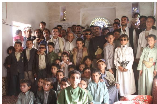
Village residents show their support for the Jebel Milhan Protected Area

“Never doubt that a small group of thoughtful, committed citizens can change the world. Indeed, it is the only thing that ever has.” - Margaret Mead